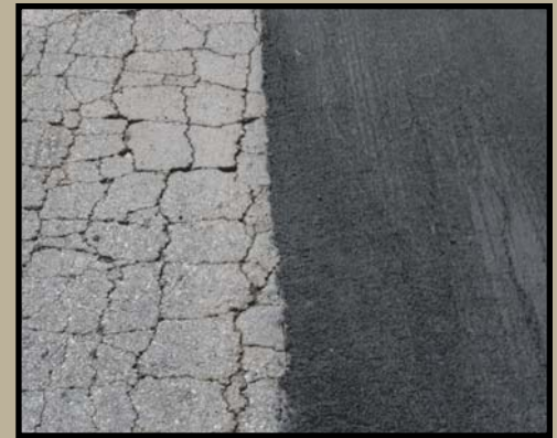
GatorGuard Protects the sub-base by forming a durable, water-tight covering.